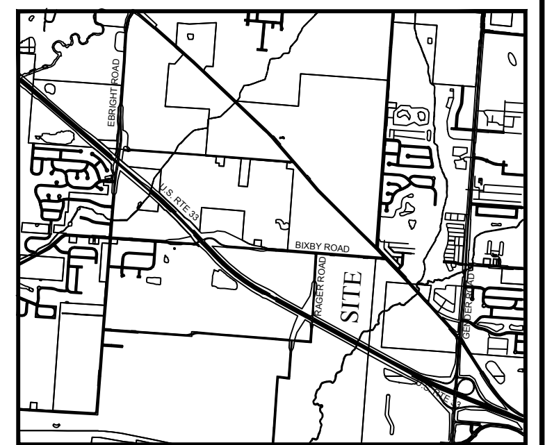
LOCATION MAP NO SCALE